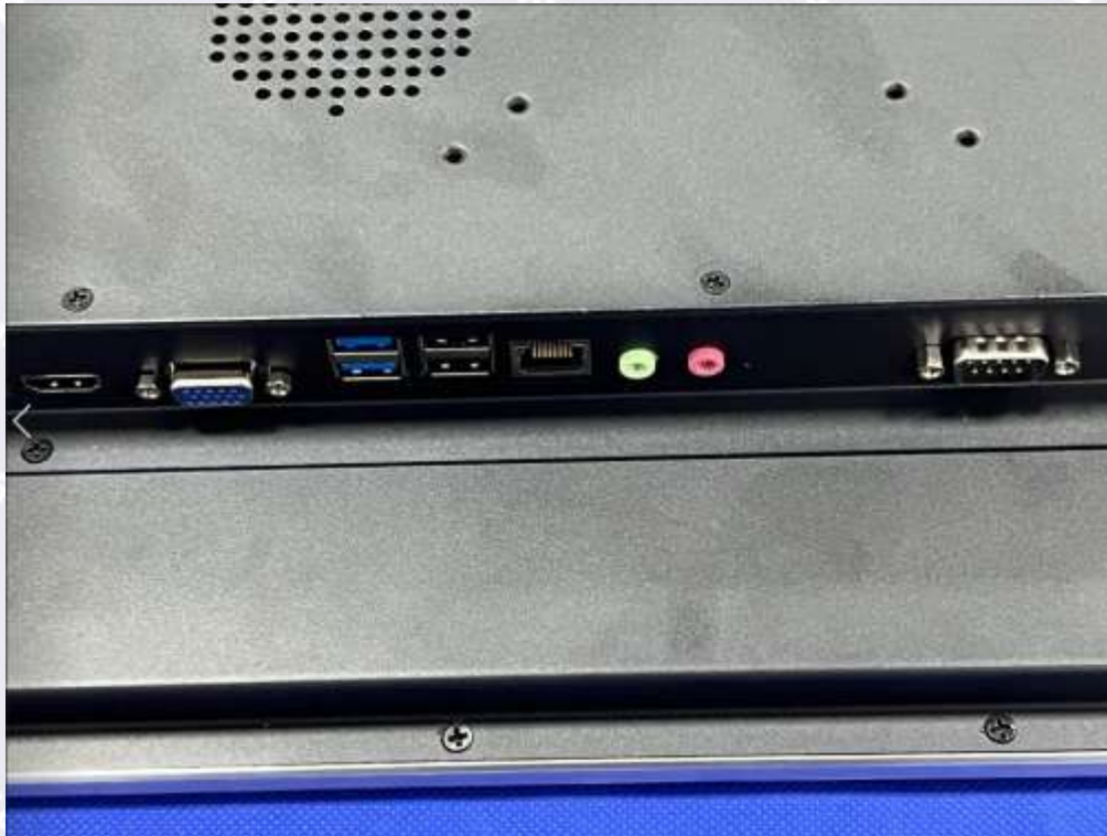
Photo 3- Terminal view