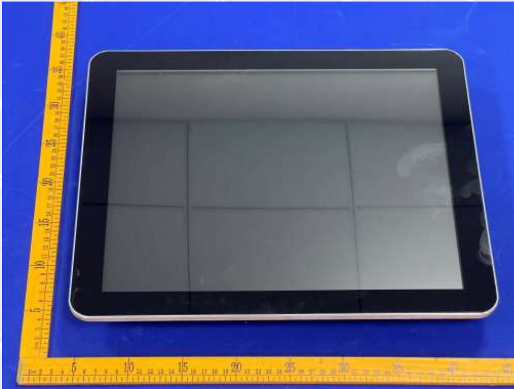
Photo 1- Overall view