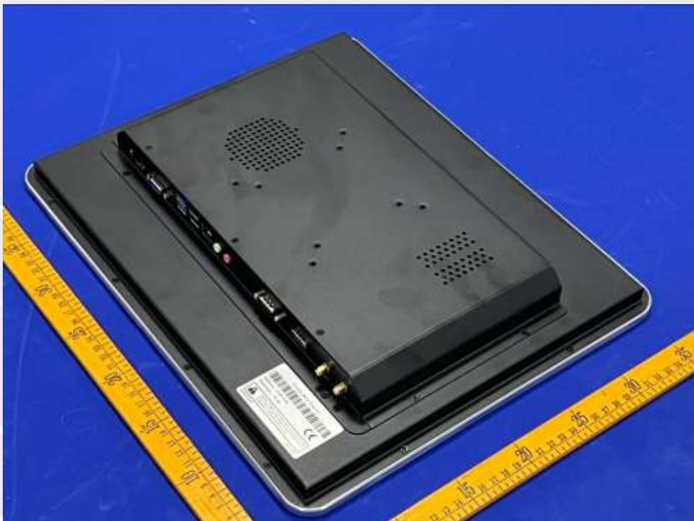
Photo 2- Overall view

Aerospace Testing Technology (Shenzhen) Co., Ltd.