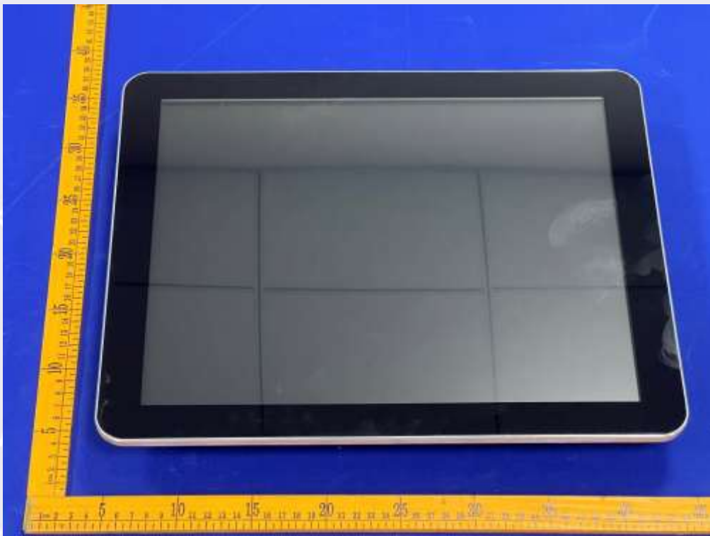
Photo 2- Overall view

Aerospace Testing Technology (Shenzhen) Co., Ltd.