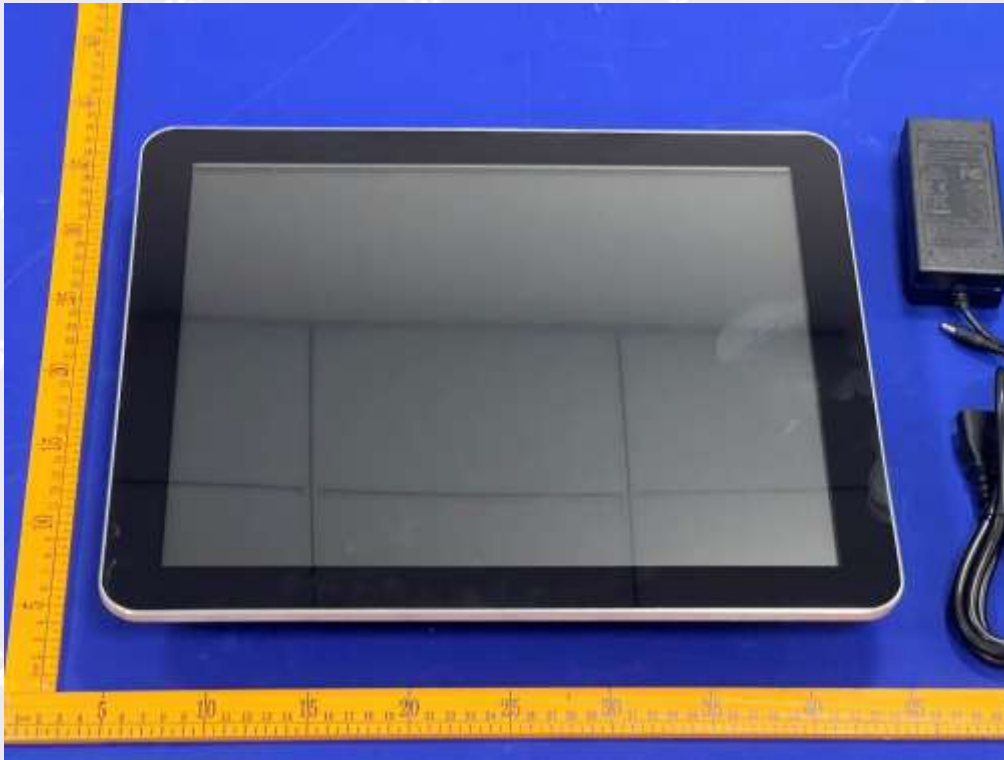
Photo 1- Overall view