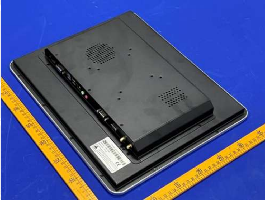
Photo 3- Overall view